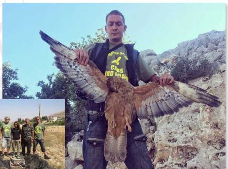
CABS member with one of thousands of Honey Buzzards shot dead in the mountains of Lebanon.