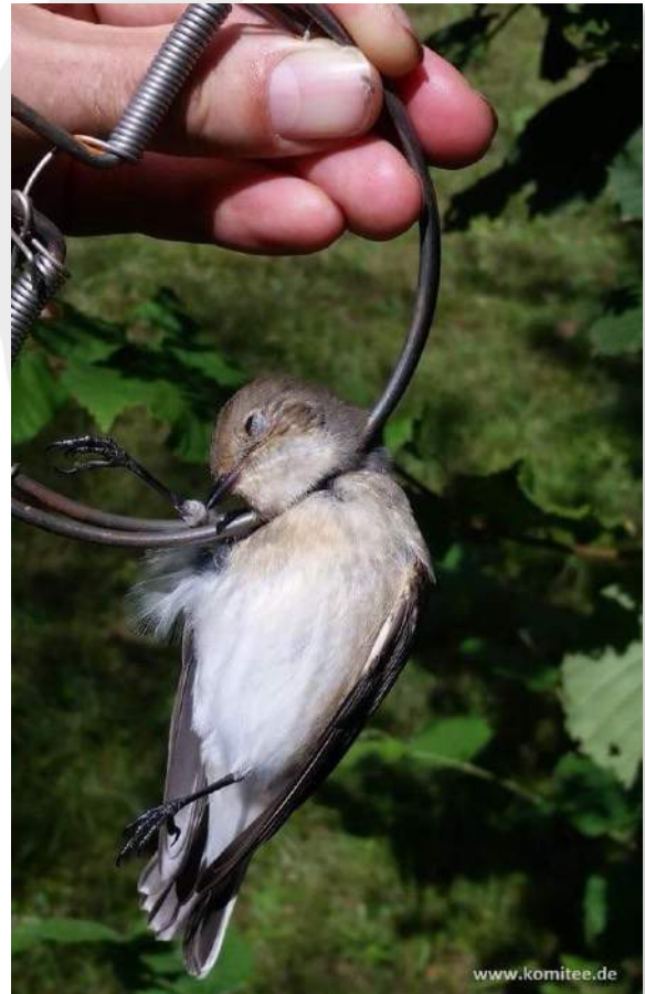
Pied-flycatcher killed by illegal snap trap in Brescia, Italy.