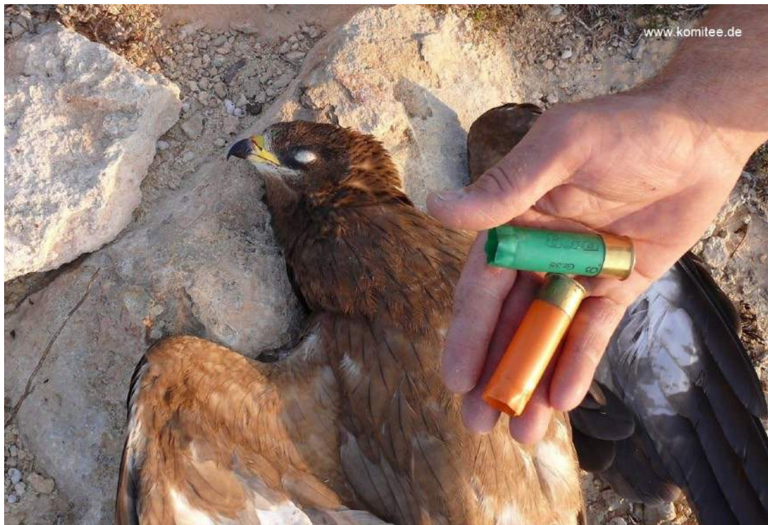
Freshly shot Honey Buzzard in Calabria, Italy.