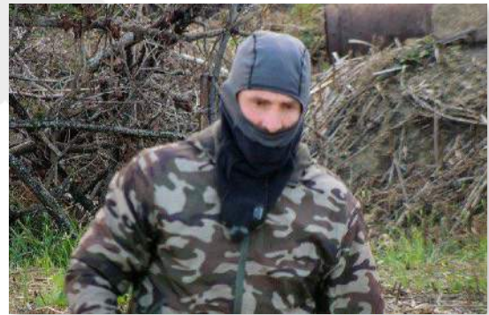
Masked poacher on Ischia