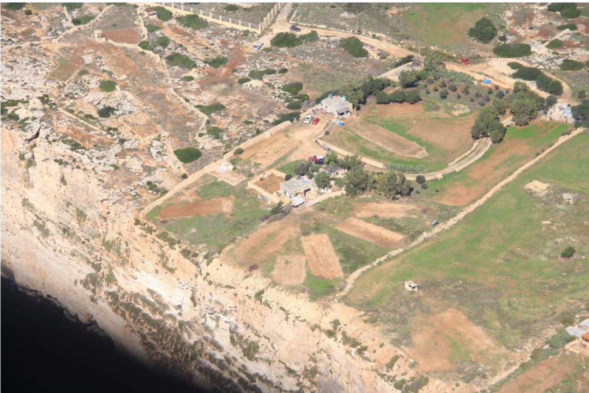
Images taken during aerial survey of Malta and Gozo showing numerous active trapping sites clustered together.